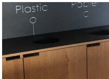
TOTAL WASTE MANAGEMENT

Certified for ISO 9001, 14001, 27001 and the 45001 Active waste management; recycling (collecting and disposal) Sustainable warehouse; LED lighting, solar tubes FSC certified wood suppliers Eco Drive on all our transport vehicles In addition to that we support Electric passenger vehicles for our colleagues 2000m2 solar panels EcoVadis Platinum rating